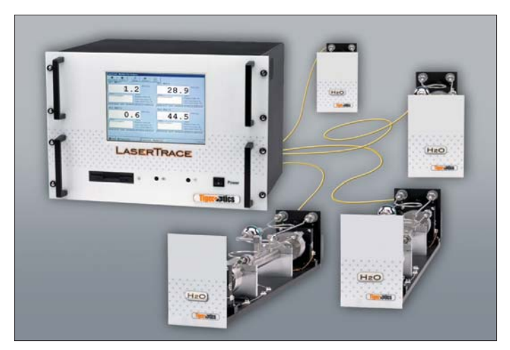
Pinpointing the source of moisture in gas lines with instruments like Tiger Optics' LaserTrace is critical to low-temperature epi.